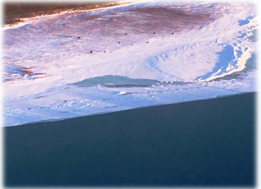
Pretty but Deadly: open water shining in the morning light