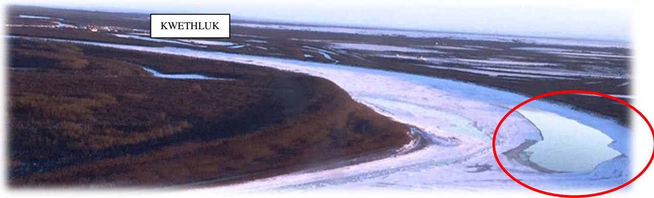
And Right above it - ANOTHER ONE