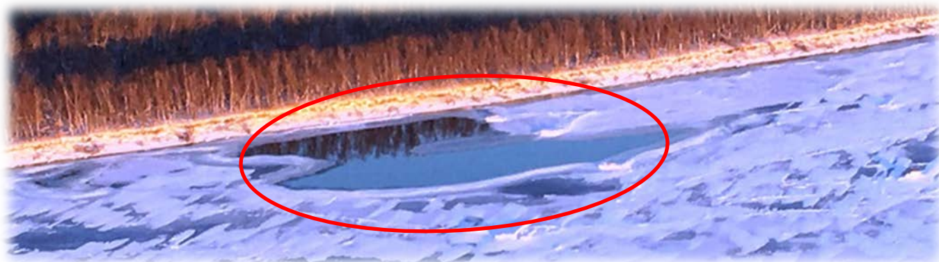
And above that - A 3 rd ONE! - ALL BELOW KWETHLUK - THERE ARE MANY MORE FARTHER UP KUSKOKWUAK SLOUGH...