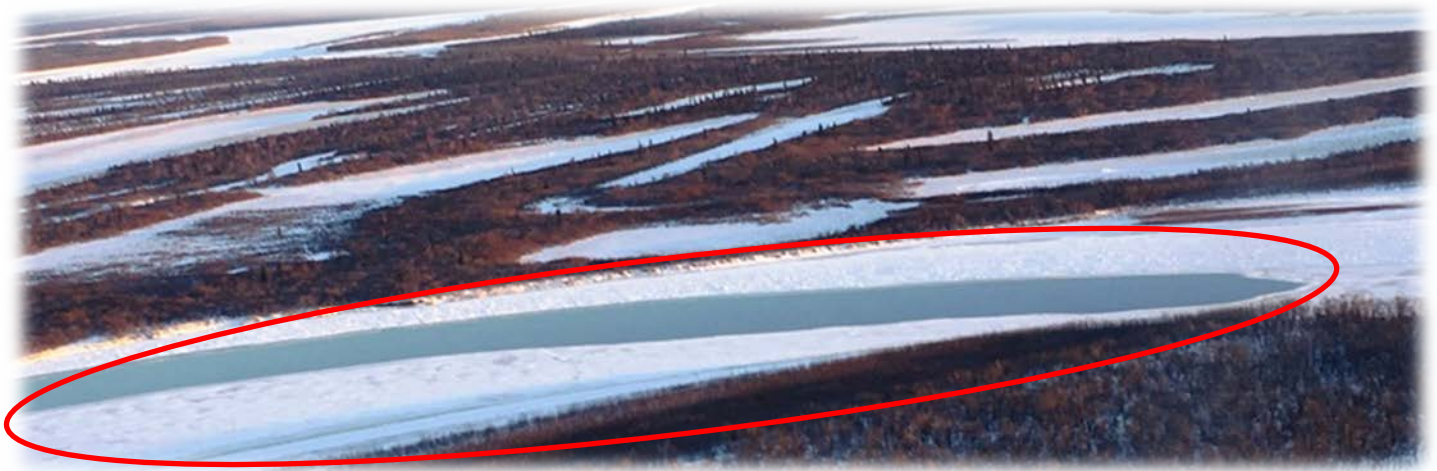
... Like this one just up around the bend from the mouth of Kwethluk River

The next two pictures show the most DANGEROUS area we observed in our 130 miles flight: