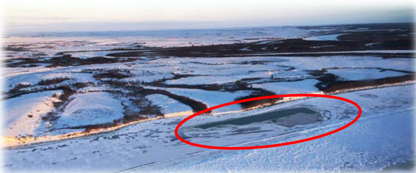
Danger Close to Home: open hole just above the Bethel Bluffs