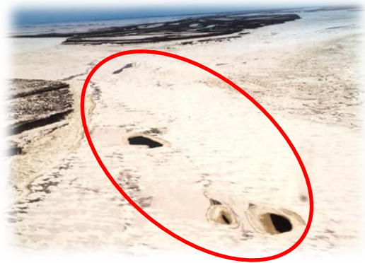
The Mouth of Johnson River is at the top left - more holes upstream