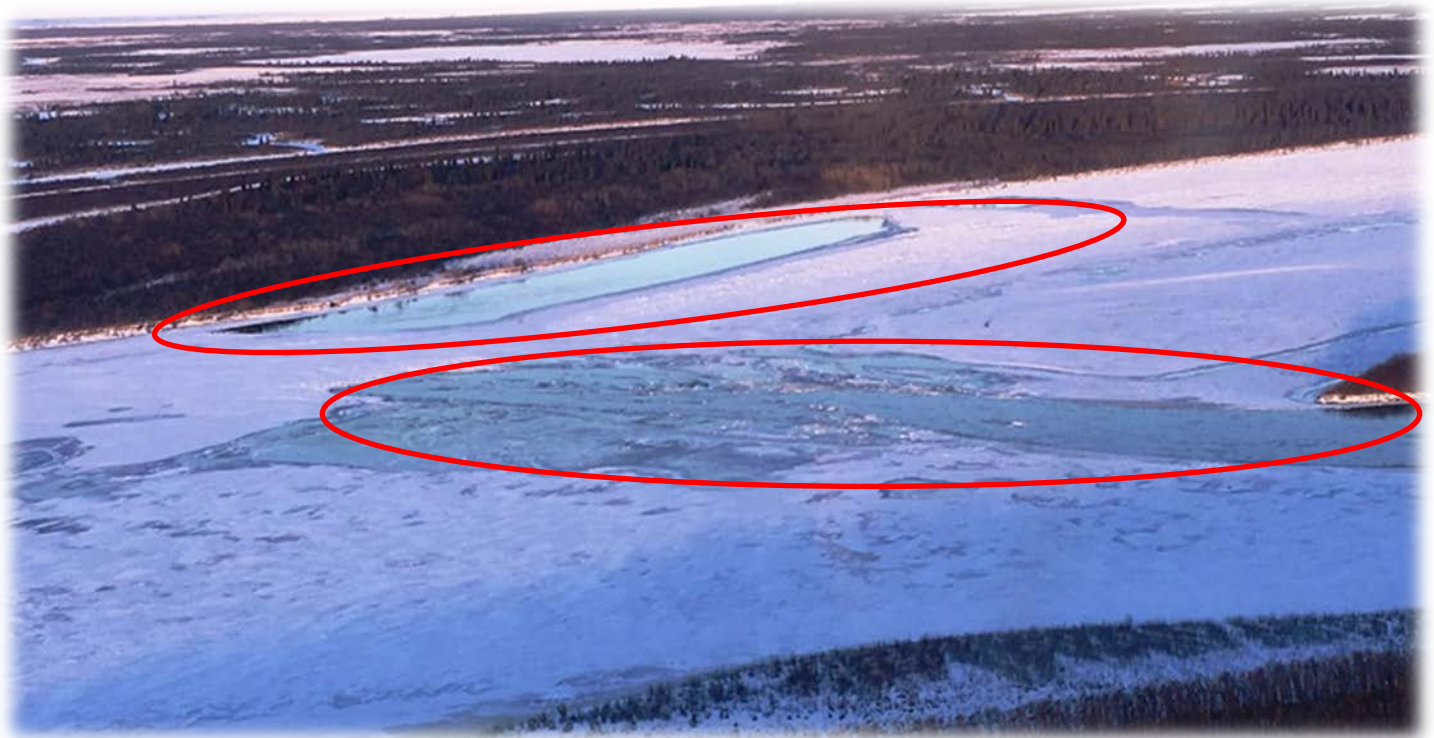
No Where to Run: This is the Kuskokwim River below Tuluksak – where the short cut slough enters main channel There is no safe place to make a River trail at this time

The next two pictures show the most DANGEROUS area we observed in our 130 miles flight: