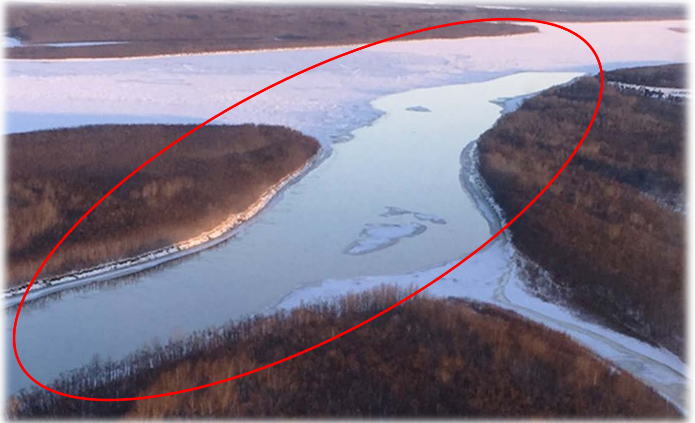
Even the short cut slough below the Tuluksak Fish Camps is wide open – also Macivik Slough is wide open