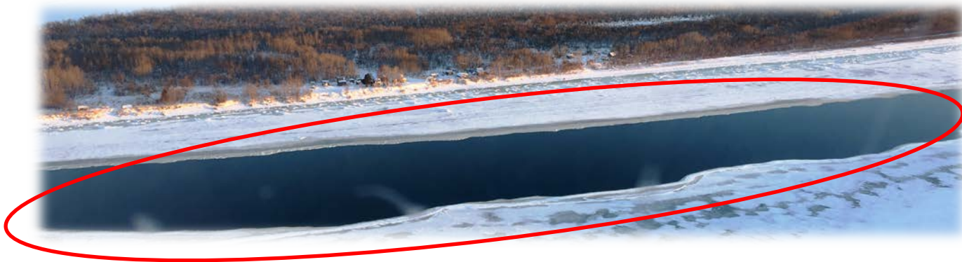
Huge Open Hole in Front of Kinegak's Fish Camp at the Lower End of Kuskokuak Slough below Kwethluk