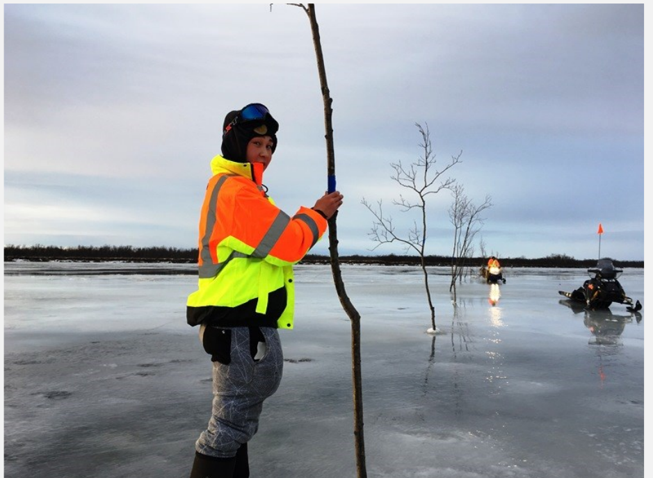
The Thin Blue Line: 90 willows with blue reflectors stretch across the lower end of Kuskokuak Slough